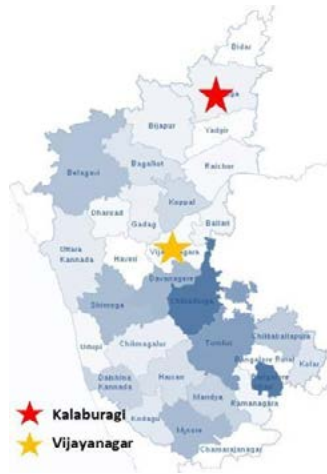
Location map of the two districts in Karnataka